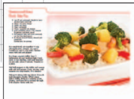
No. 5351 Recipe on the Back of each page